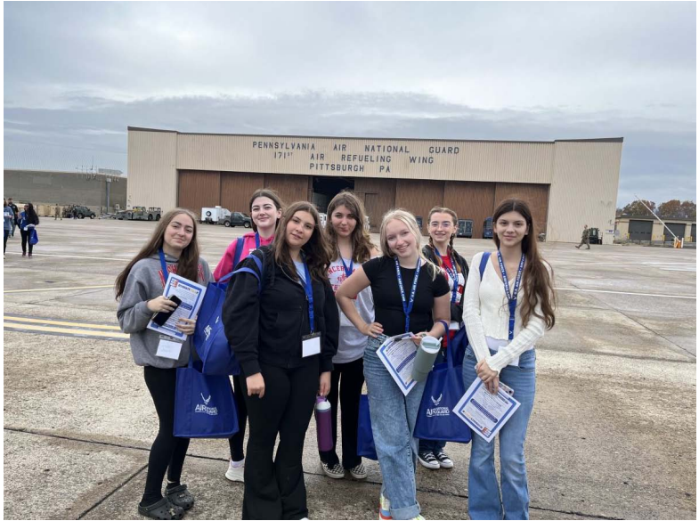
US Air Force Leadership Day