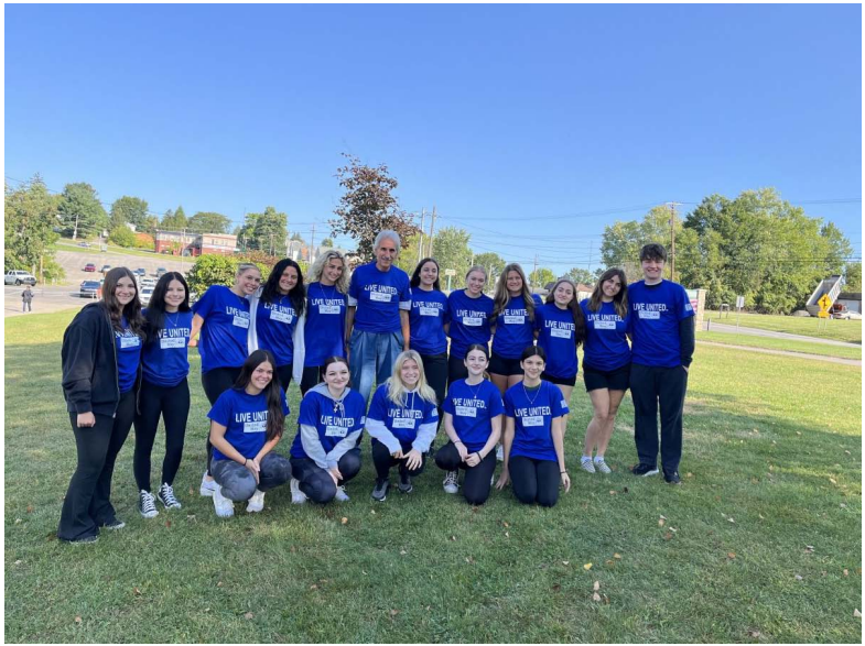
United Way Day of Caring 2024