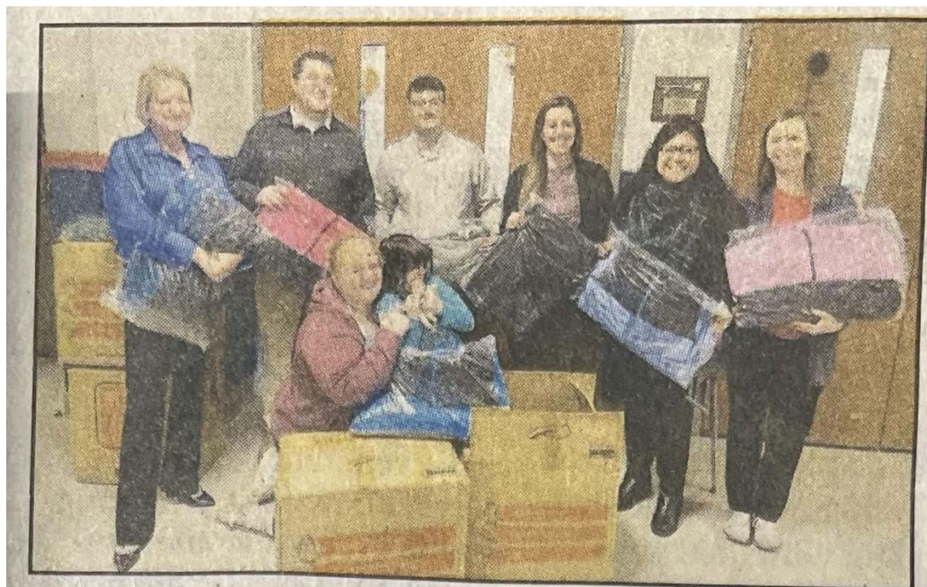
Rotary Club of Bradford

More than 156 local children received brand new coats from Rotary Club of Bradford's participation in Operation Warm.