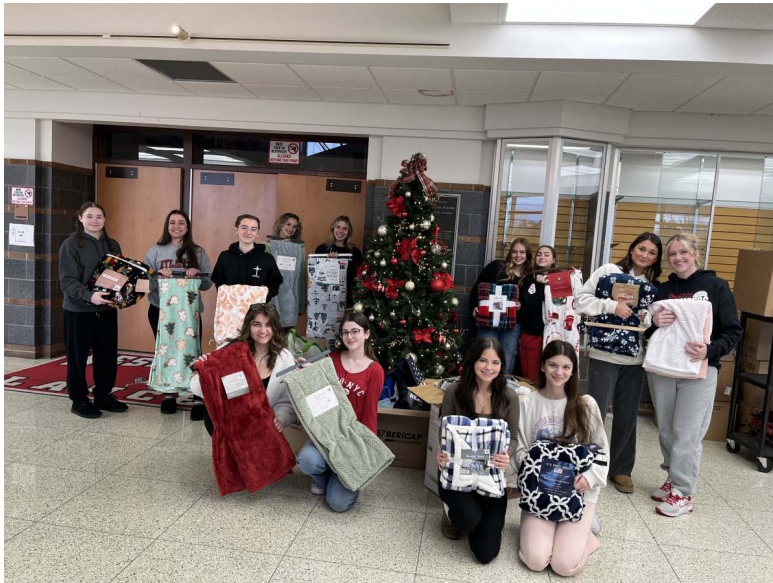
Blanket drive - 250 collected for United Way and local Nursing homes

We started with 10 students this year and have already grown to 24. Word spreads fast that we are a service group and that we have superb mentors in the Club #89.