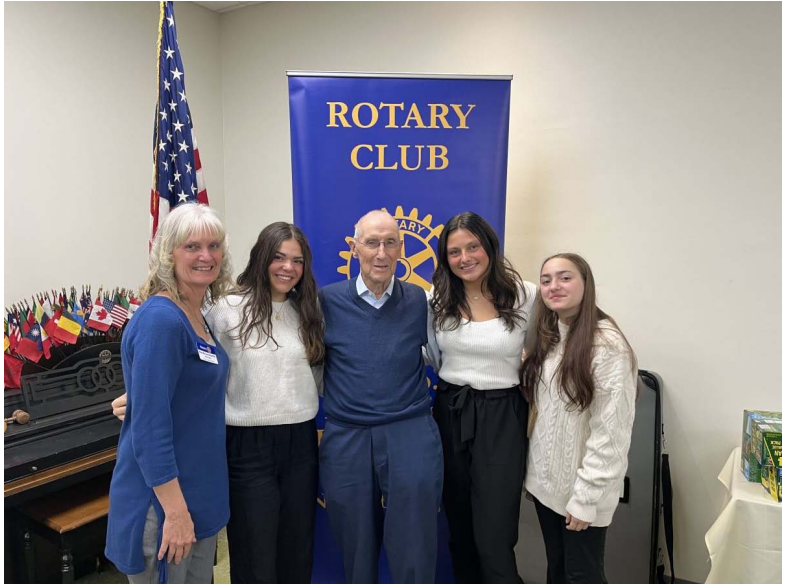
Rotary lunch with WWII Veteran