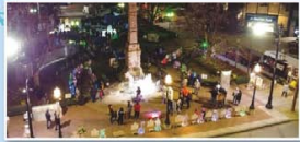
Location – Diamond Park & Main Street in Butler

Proceeds help support Butler AM Rotary Charities Annual Giving Fund and Ellen's House thru the Ellen O'Brien Gaiser Center.