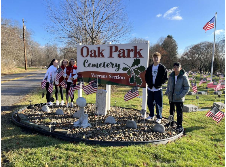
Veteran flag removal at local cemeteries