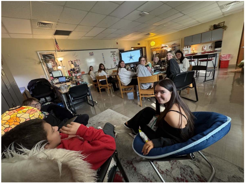
Dallas Cowboys character Playbook Series -Salute to Service live presentation with learning support students