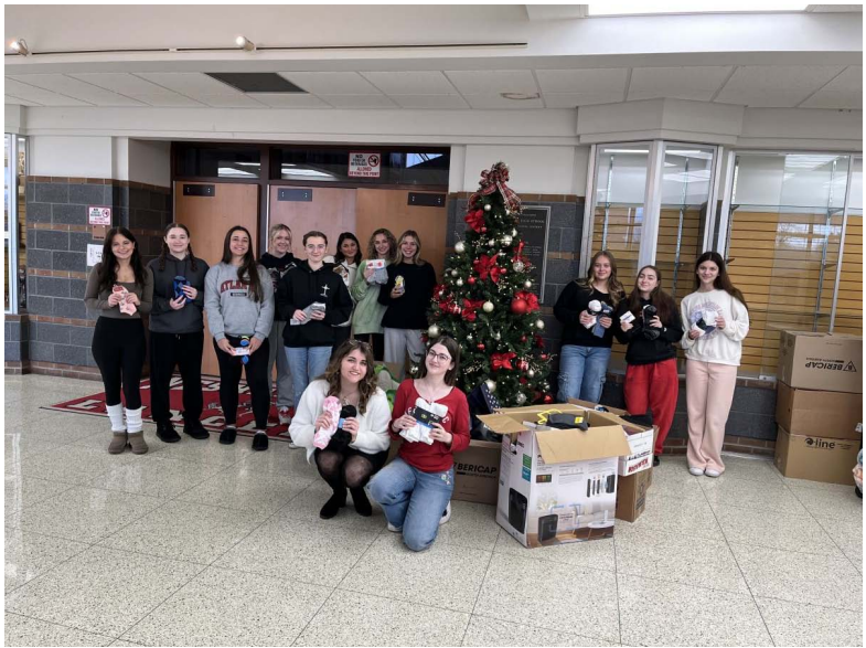
SOctober collection. Collected 1300 pair new socks for local agencies and district families