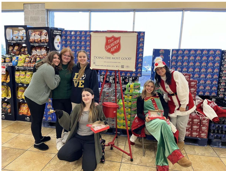
Salvation Army Red Kettle bell ringing